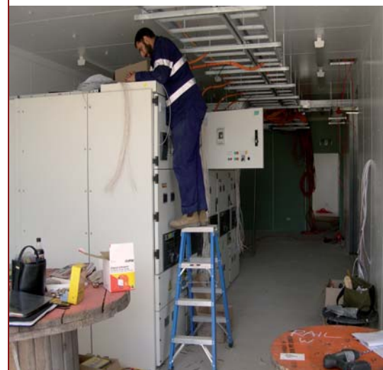
Capillary tubes branch off the main VESDA sampling pipe and into the equipment cabinet, allowing the earliest possible warning of smoke within the cabinet.