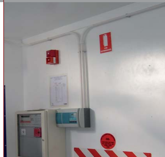
A VESDA detector can be installed inside the portable substation or switchroom whilst it is being built or retrofitted onsite.